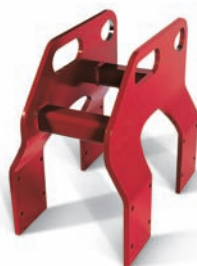
VMS Ho-Pac® Side-Frame

For sales and service, contact your Allied Distributor: