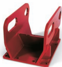
VMS Top-Mounting CS Bracket

Mounting Bracket Type Descriptions: BCS-Backhoe Top-Mounting SCS-Small Excavator/Backhoe Top-Mounting MCS-Medium Excavator Top-Mounting LCS-Large Excavator Top-Mounting